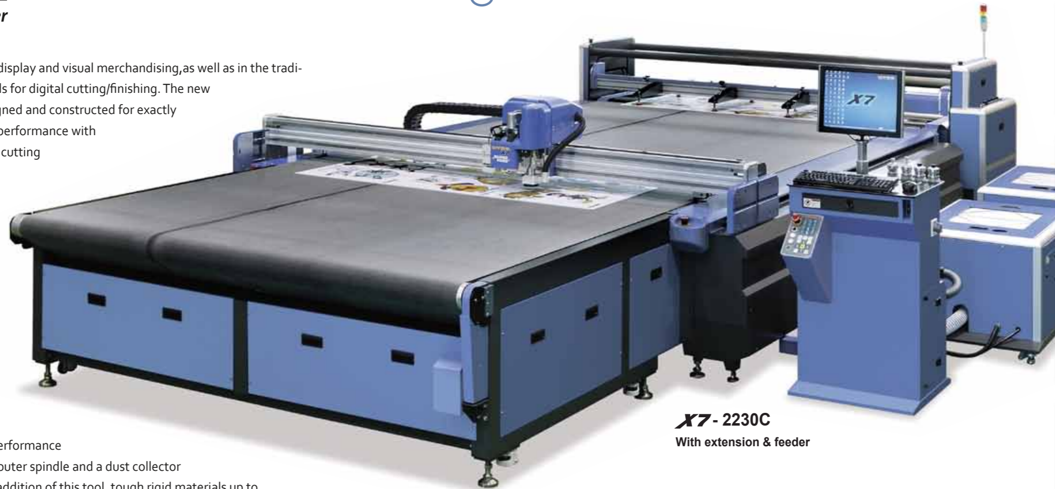
X7-2230C With extension & feeder

With other state of the art options such as the rigid material feeding system and the extension table, the new DYSS DGS V-PRO can become a fast, powerful, automated finishing system to provide maximum productivity and smooth work flow to comply with today's highest market requirements.