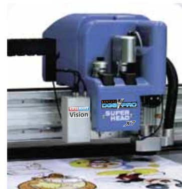
Super Head For two sleeves & 1kw Router

Its powerful cutting heads, "SuperHead" or "TripleHead", with their wide variety of tool inserts give the utmost flexibility to suit all needs. Both heads can handle a vast range of materials, including vinyl, paper, paper foam, styrene, pvc foam, Falconboard (honeycomb board), corrugated cardboard, displayboard, magnetic film, textiles and many more.