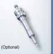
SPT (Sleeve Plotter Pen Tool)