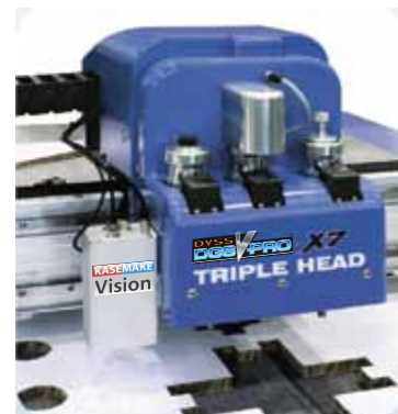
Triple Head For three sleeves

The "Super-Head" offers the option of a high performance 60,000rpm 1KW router spindle and a dust collector system. With the addition of this tool, tough rigid materials up to 25mm thick such as acrylic, wood, MDF, polycarbonate, aluminum composite sheets (Alucobond, Dibond, etc.), among others, can also be precisely cut.