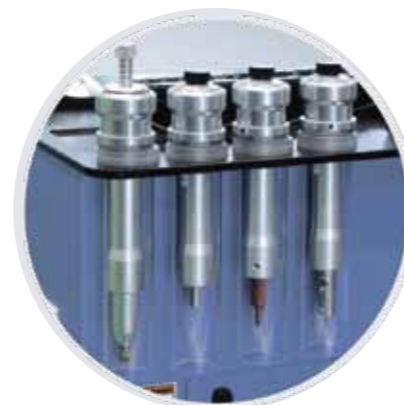
Tool Holder (Included)