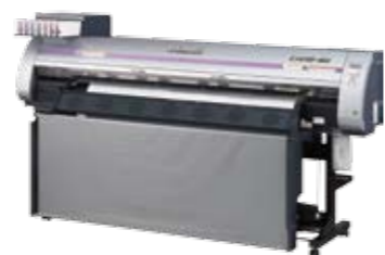
CJV30-160 equipped with a drying and exhaust unit 160